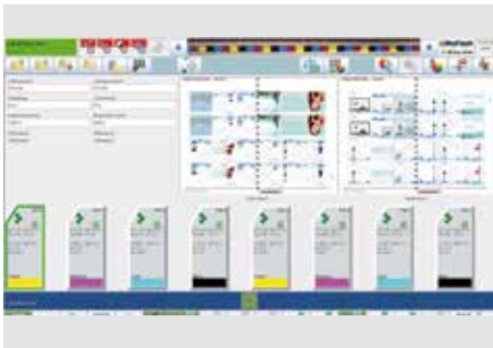
User-friendly system control