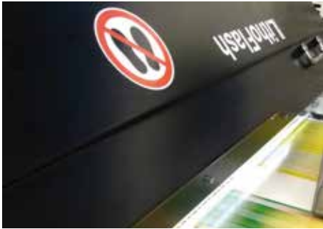
LithoFlash at a webpress