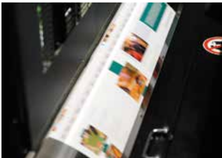
LithoFlash at a sheet feed