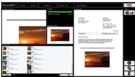
Prepared job time ticket for print