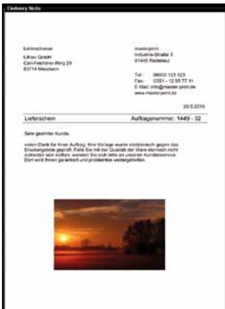
Convenient print of delivery note