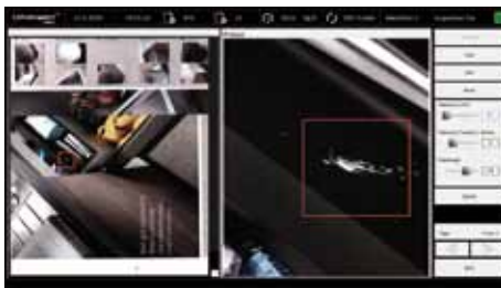
Image matching software in scope of supply