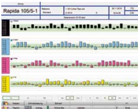
Measured value display for density control